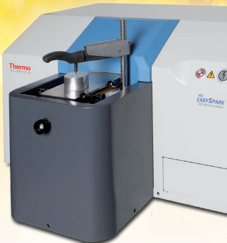
Thermo Scientific ARL easySpark Optical Emission Spectrometers